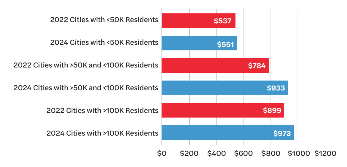
Change in Average Donor Limit of Different-sized Cities with Limits < AB 571

The City of Escondido repealed all of its local campaign finance reforms, decreasing the total number of MCFI cities from 180 to 179. Escondido is now obligated to comply with the state's default campaign contribution limit.